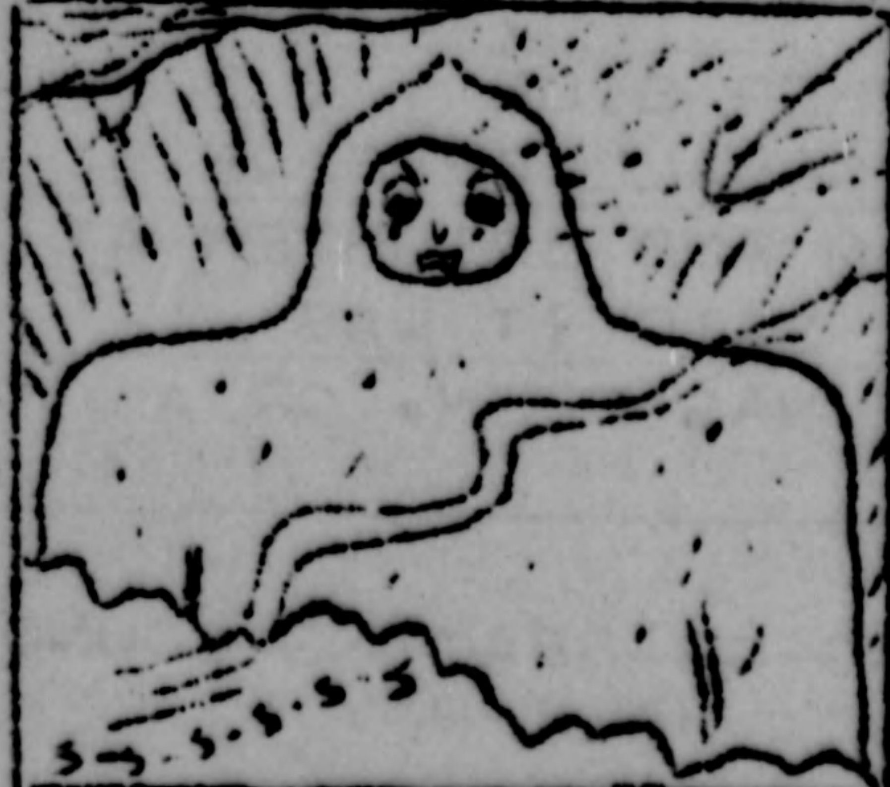
*An INFINITI Hall-of-Fame Adventure, from File.

EXCLUSIVE INTERVIEW WITH ON-THE-SPOT INVESTIGATOR REVEALS INTERESTING FACTS . . .